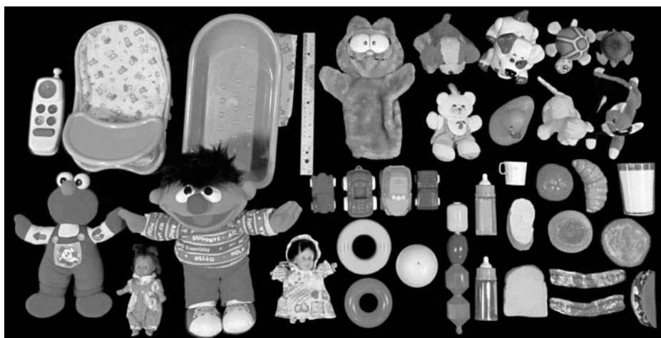
FIGURE 1 Toy objects presented by the Spanish-speaking tutors (with ruler included to show size).

gaze shift was calculated for each infant for each session, and averaged across the two sessions for the “gaze-shift proportion.” A “face-only proportion,” “toy-only proportion,” and “look-away proportion” were similarly calculated. Rater agreement was determined by having an independent coder rate one session for each infant. The inter-rater agreement for infants’ gaze behavior was excellent (Cohen’s kappa = .81).